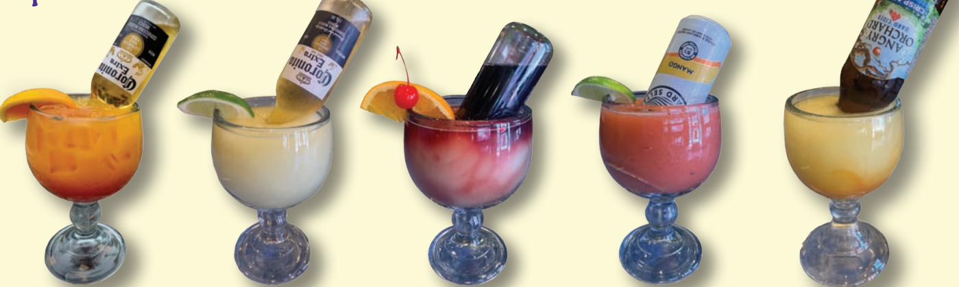
Corona Sunset Flip